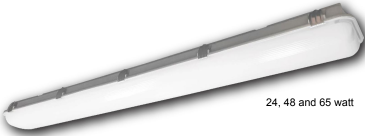
24, 48 and 65 watt