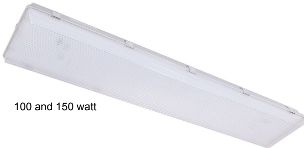
100 and 150 watt